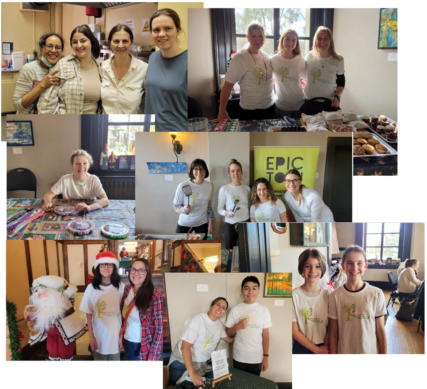
Volunteers at the Art. Etc. 'Lunch With the Library'