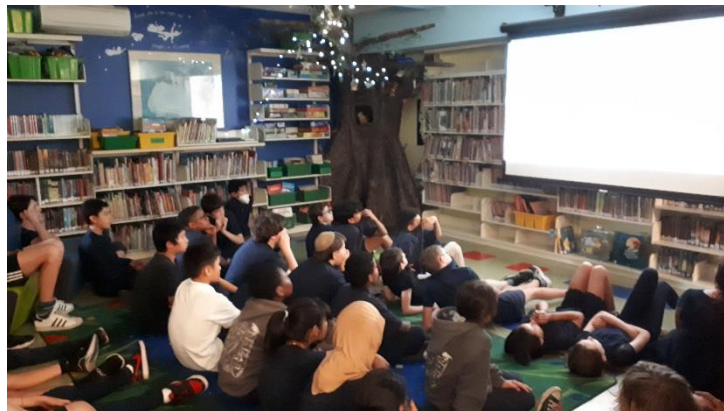
After the Trivia Quiz, students from grades 6 watch the movie 'Holes' based on the book we read through the year

The traditional Skate-a-Thon fundraising initiative did not take place in 2024 due to the construction of the Arena. Two teachers organised a Read-a-thon instead. The students were recording the number of pages read for one week in March, and the total amount for the school was 22 920 pages. The grades with the highest number of pages received gifts for the classroom – board games and books. We also treated the students to hot chocolate and cookies at the end of the fundraiser. The Library raised close to $1 000.