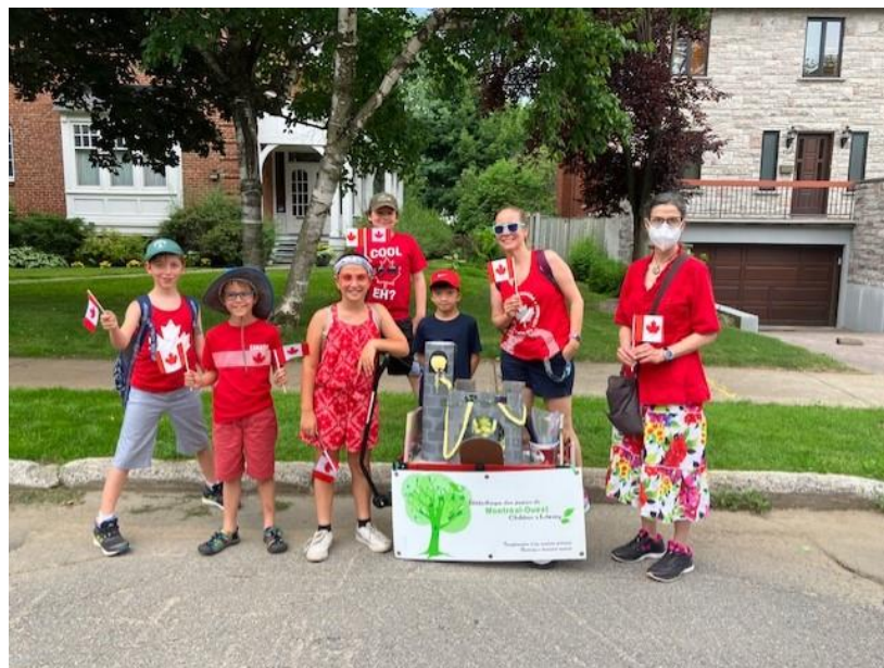
The Library float for the Canada Day Parade, accompanied by parents and children – members of the Library

The Community Nights organised by the Town of Montreal West have returned, so did our participation at those events. The Library's stand features publicity for events, books, games for the passers-by, as well as sale of Freezes which goes toward our fundraising income. We took part in St. Jean-Baptiste day and Canada Day as well, with a beautiful float led by loyal members of the Library.