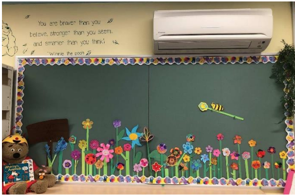
Paper Flower Garden (April-June 2022)

Here are pictures of the collaborative initiatives we had organised at the Library. They adorn the Library and make it a bright, happy place. Every visitor has had a chance to take part in these, during regular visits: